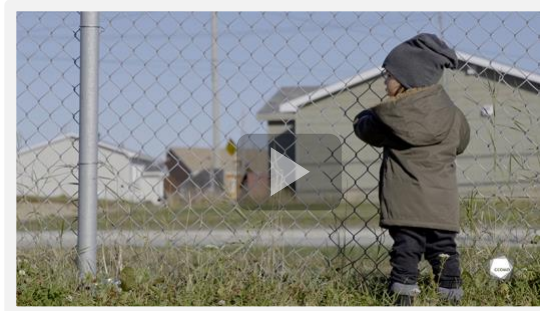
Video: Outside play